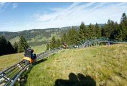
Alpsee Coaster in floodlights

Opening times: 11.07. - 06.09. Chairlift and climbing-forest 09:00 - 19:00 / Alpsee Coaster: 09:30 - 19:00 The Alpsee Coaster is Germany's longest all-season toboggan run and in almost any weather into operation. At a length of nearly 3,000 meters, the distance from the upper station of the chairlift leads directly to the "toboggan host" beside the station.